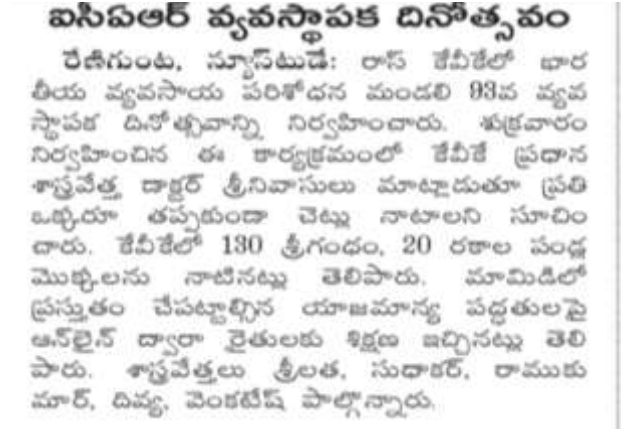
Press clippings of the programme