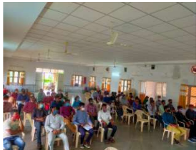
Participants attended to the programme