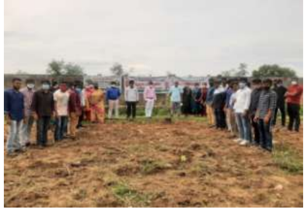
Plantation Drive at KVK farm