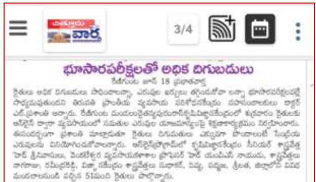
Press clippings about the programme